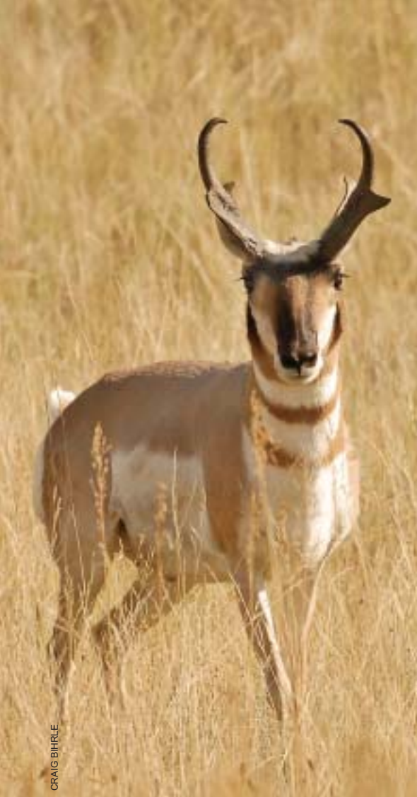
Percent of applicants who received their first choice of license in the 2007 Pronghorn drawing.