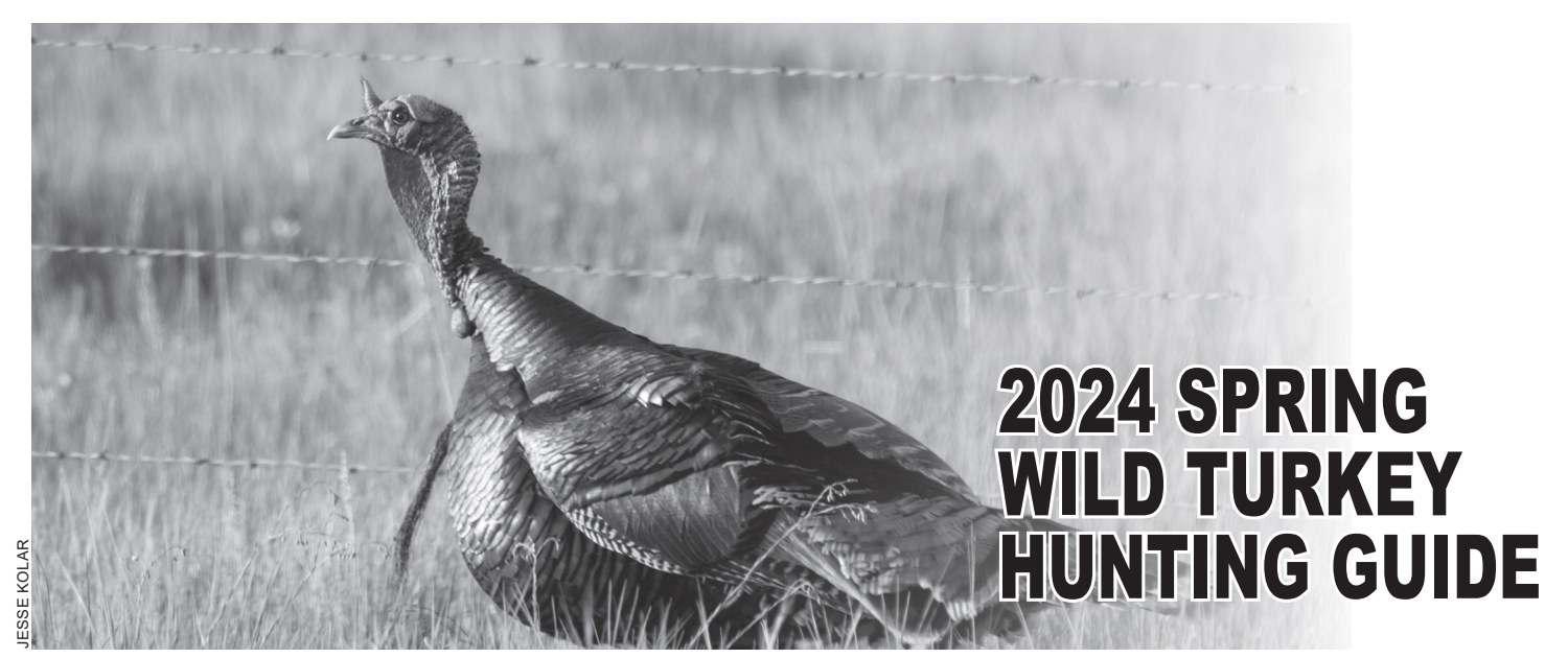
This guide is provided for informational purposes and is not intended as a complete listing of regulations. For other specific information on regulations and laws, visit the Game and Fish Department website at gf.nd.gov or for North Dakota state laws go to legis.nd.gov/cencode/T20-1.html.