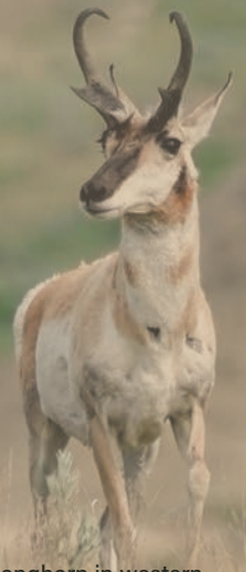
Pronghorn in western North Dakota.

"To be remarkably successful in killing game a man must be a good shot; but a good target shot may be a very poor hunter, and a fairly successful hunter may be only a moderate shot."