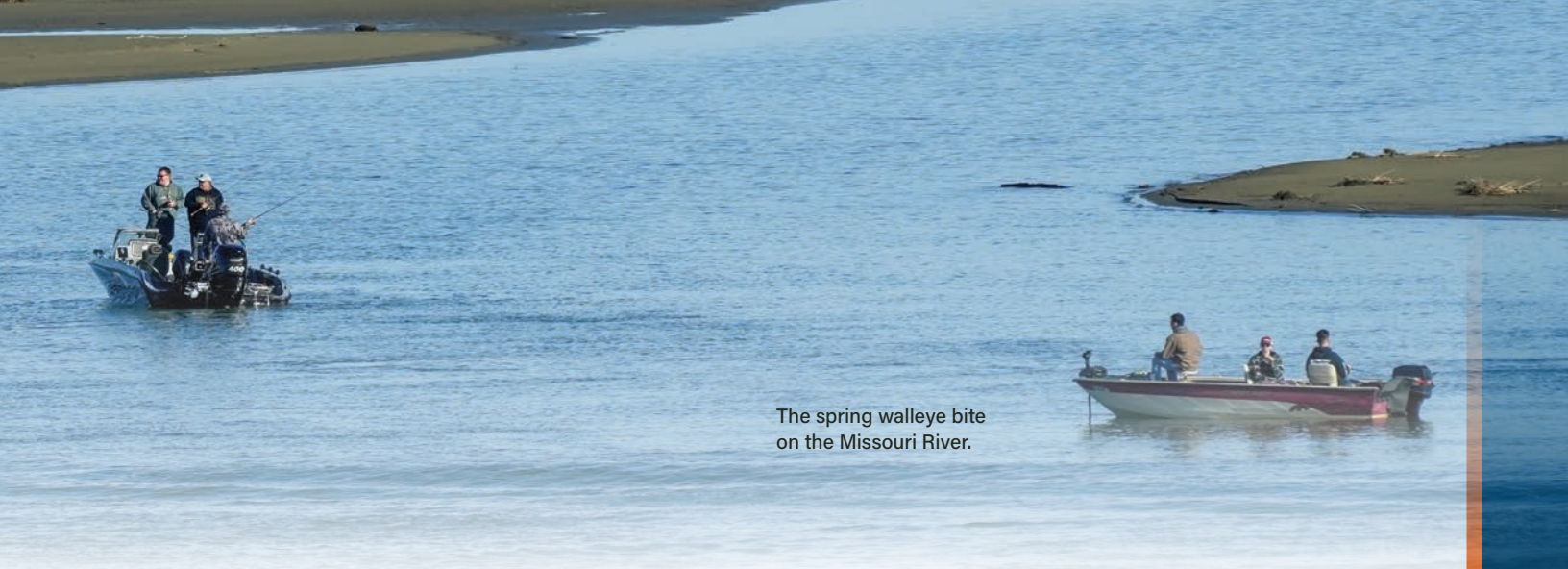
The spring walleye bite on the Missouri River.

13-20 inches and anglers elect to release many of the larger walleye that they catch. Thus, applying a maximum (or one-over) would likely not reduce the harvest of large walleye.