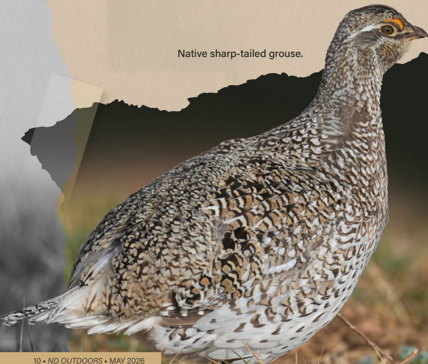
Native sharp-tailed grouse.

"The sharp-tailed prairie fowl is much the most plentiful of the feathered game to be found on the northern cattle plains...it is, however, essentially a bird of the wilds, and it is a curious fact that it seems to retreat before civilization, continually moving westward as the wheat fields advance."