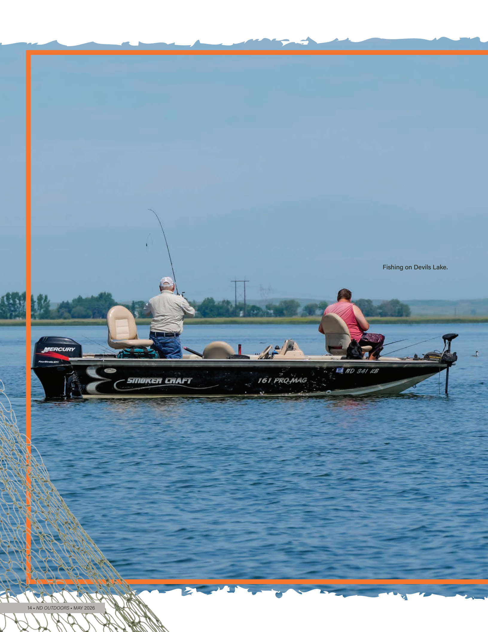
Fishing on Devils Lake.