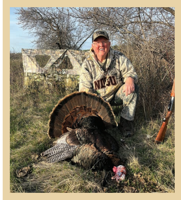
My hunting partner.

We're not close enough to hear the big birds thump to the ground when they leave the trees, but their dark shapes are easy to see in the low light when they do at 400-plus yards. The big toms, having played this