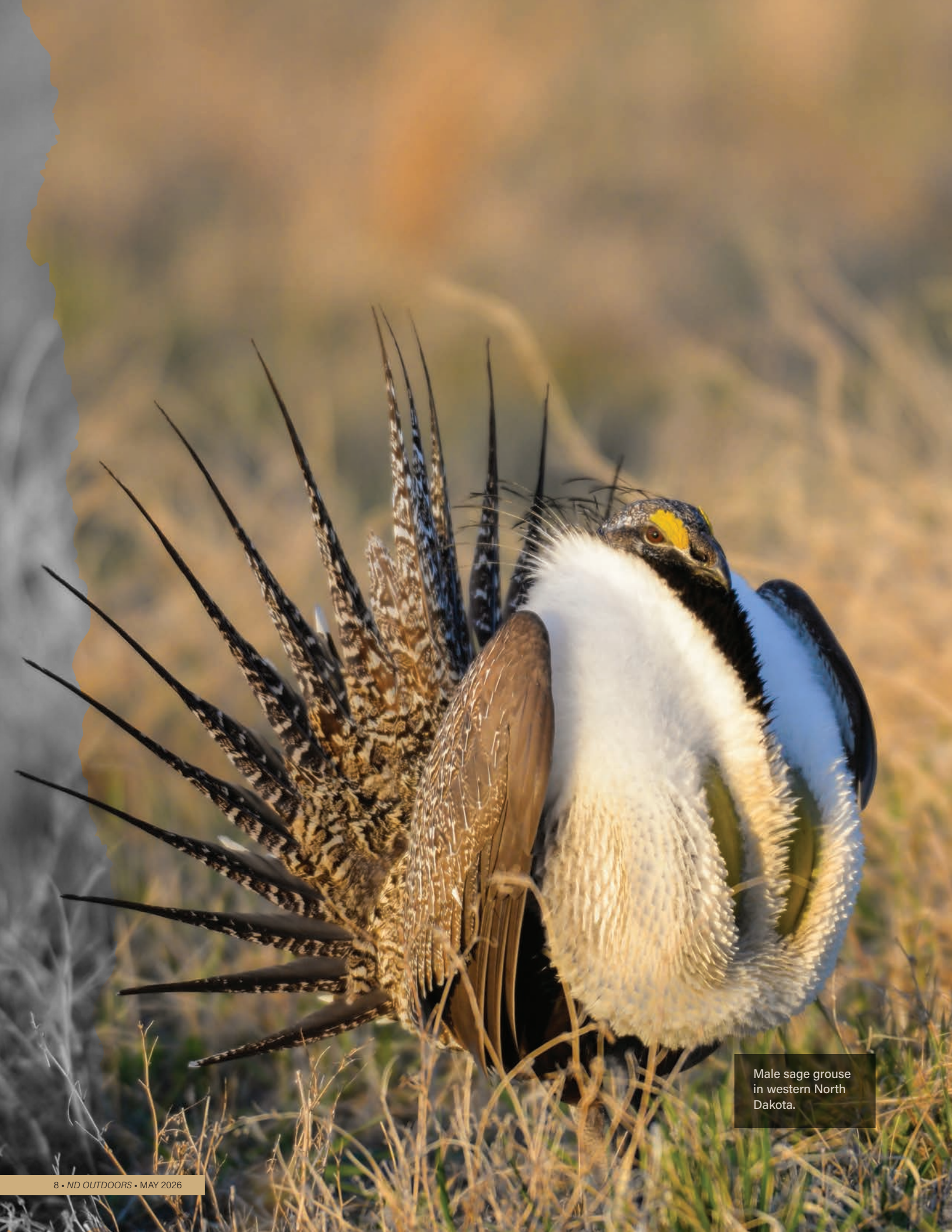
Male sage grouse in western North Dakota.